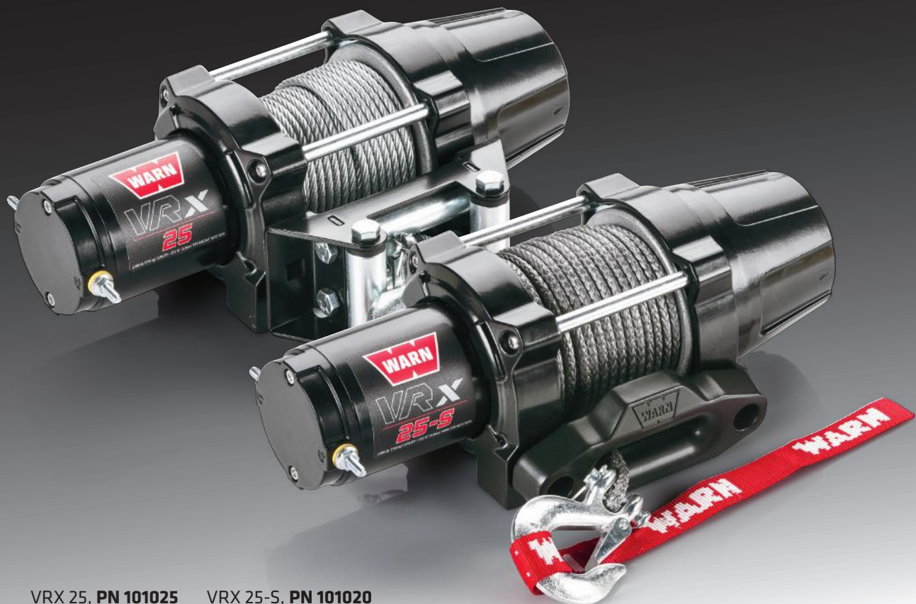
VRX 25, PN 101025 VRX 25-S, PN 101020