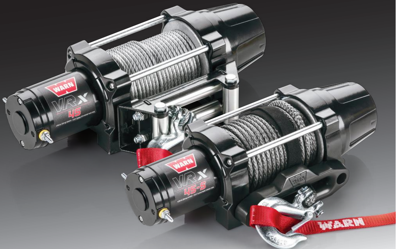
VRX 45, PN 101045 VRX 45-S, PN 101040