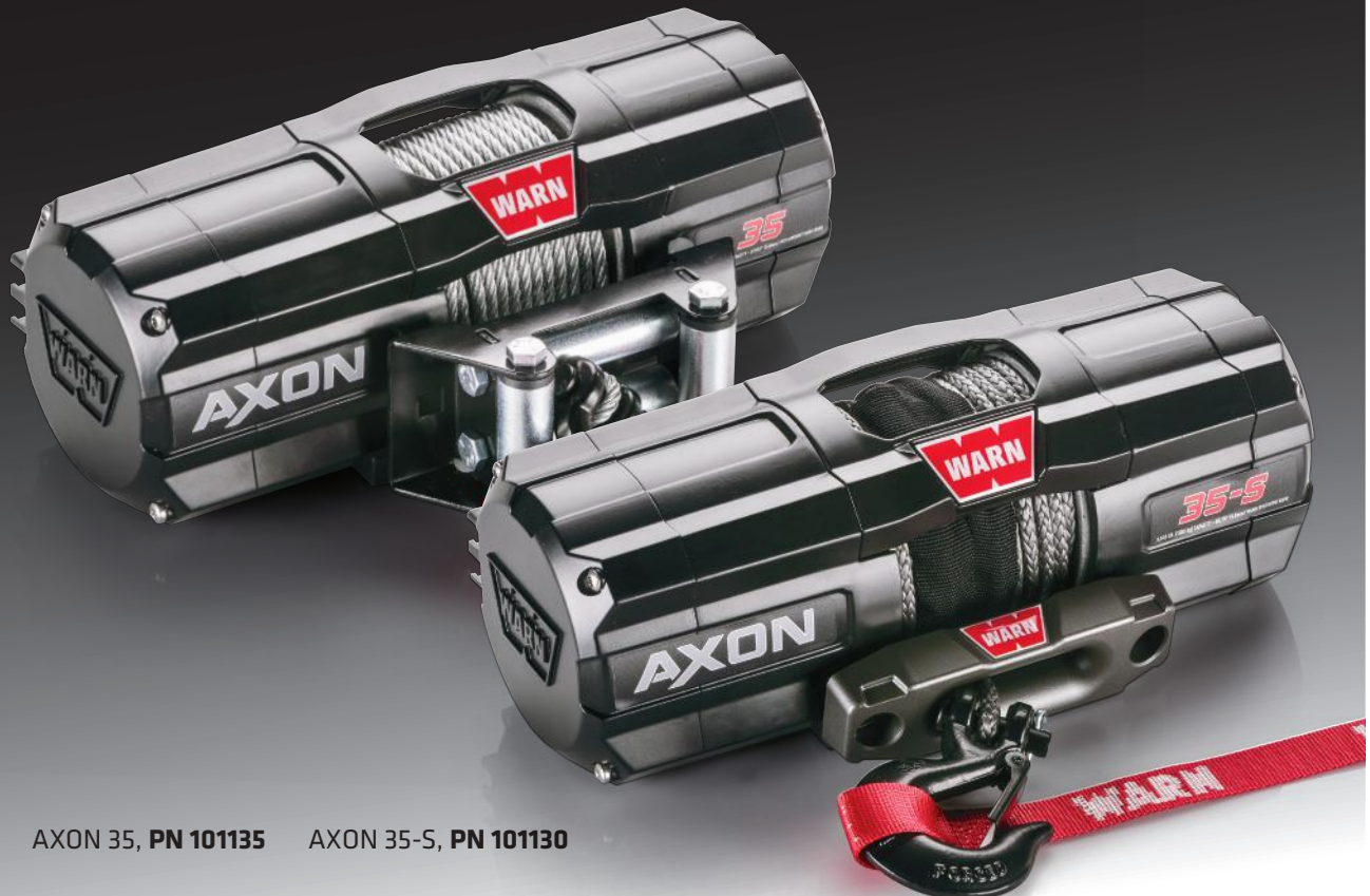
AXON 35, PN 101135 AXON 35-S, PN 101130